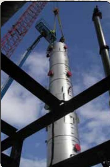
Photo sequence: A distillation tower is lifted into place at the Petro Star refinery in Valdez.

Petro Star is installing a distillate hydrotreater and associated process units at its Valdez plant. The hydrotreater will allow Petro Star to desulfurize diesel fuel to meet specifications established by the Environmental Protection Agency. At peak construction, the Project will employ over one hundred fifty workers, and Petro Star will add approximately twenty permanent refinery positions to operate and maintain these new facilities. 💧