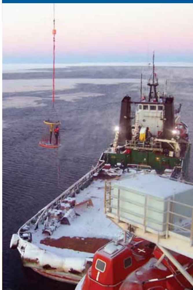
Above: Killabuk support vessel in the Outer Continental Shelf.