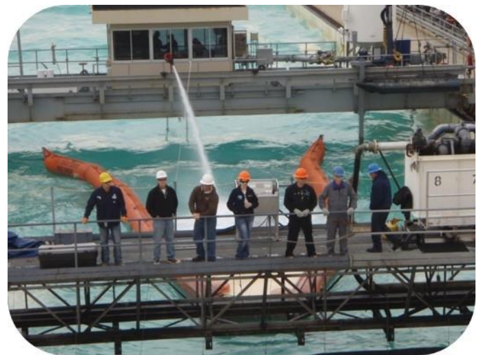
Spill Response Drills, Alaska Clean Seas, 2015

In 1989, after the Exxon Valdez oil spill, lawmakers added a 5 cent per barrel surcharge to fund the account. Legislation also established a $50 million reserve account within the fund to be used for responses to oil and hazardous substance releases. The fund could be used to review oil discharge prevention and contingency plans, conduct drills and training, and verify financial responsibility.