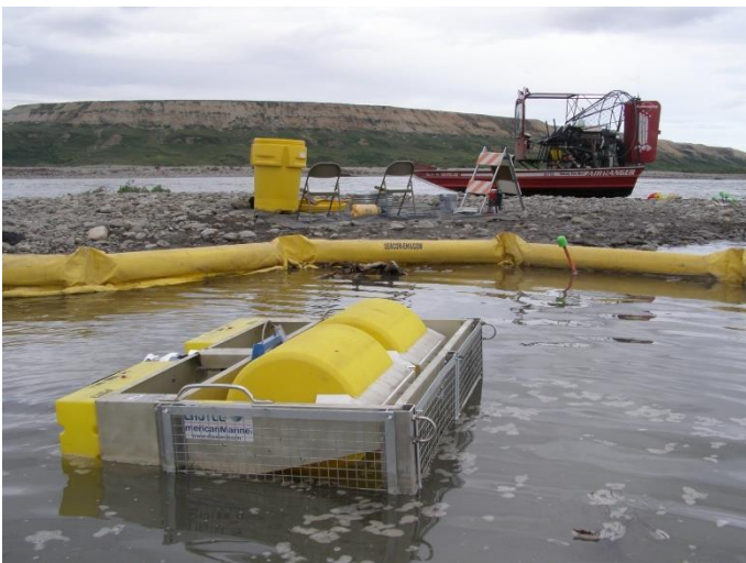
Spill Response Equipment, Alaska Clean Seas, 2015

In addition, oil and gas companies belong to not-for-profit spill response cooperatives, such as Cook Inlet Spill Prevention and Response, Inc. (CISPRI) and Alaska Clean Seas (ACS). These are full-response organizations that provide the personnel, material, equipment, and training to members for responding to oil spill. Membership fees start at $500,000 for producers, and $100,000 for non-producers, with a $20,000-50,000 annual fee. Daily exercise or development fees range from $1,250-2,500.